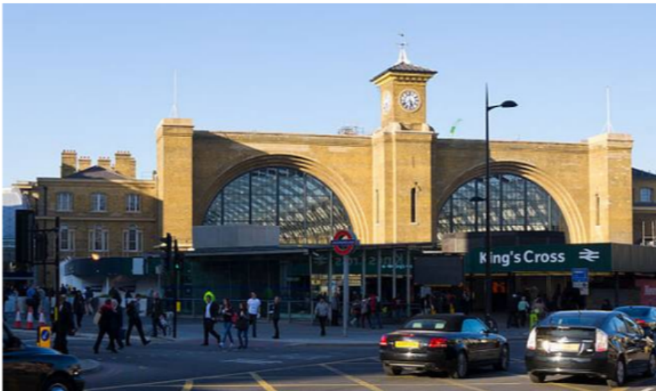
King's Cross Station, 2012

Like 28 Tweet 23 Pin it Share 8+1 0 Share